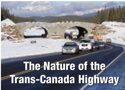
The Nature of the Trans-Canada Highway

Trans-Canada Highway construction is underway. Please obey construction-zone signs and flag people. Anticipate some delays.